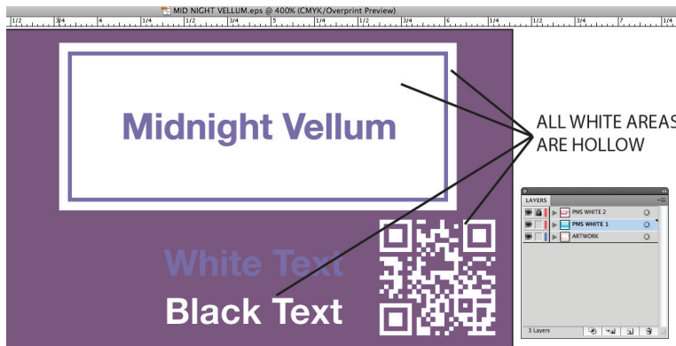
Overprint preview with the artwork on the base layer