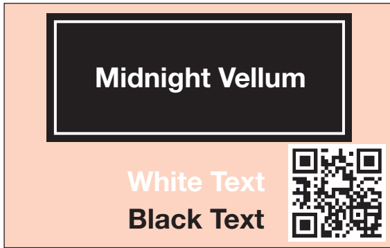
The black color is to represent M36 Black Vellum